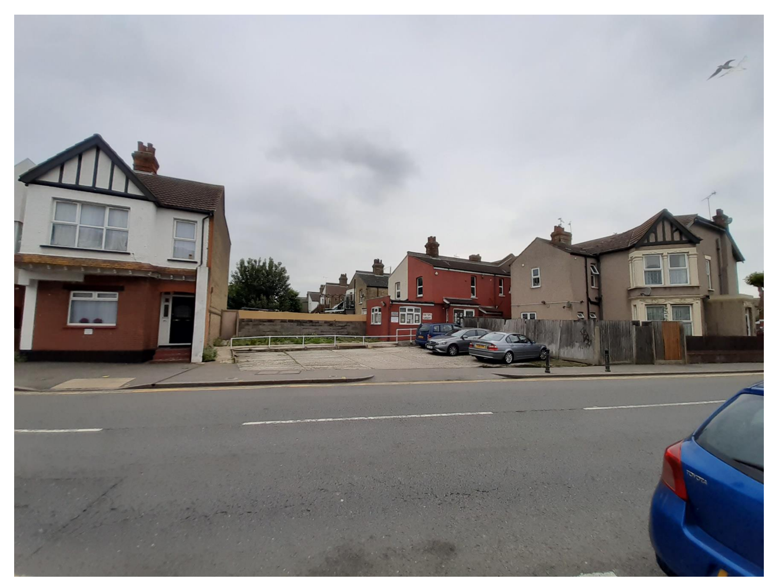
The frontage of the site on London Road