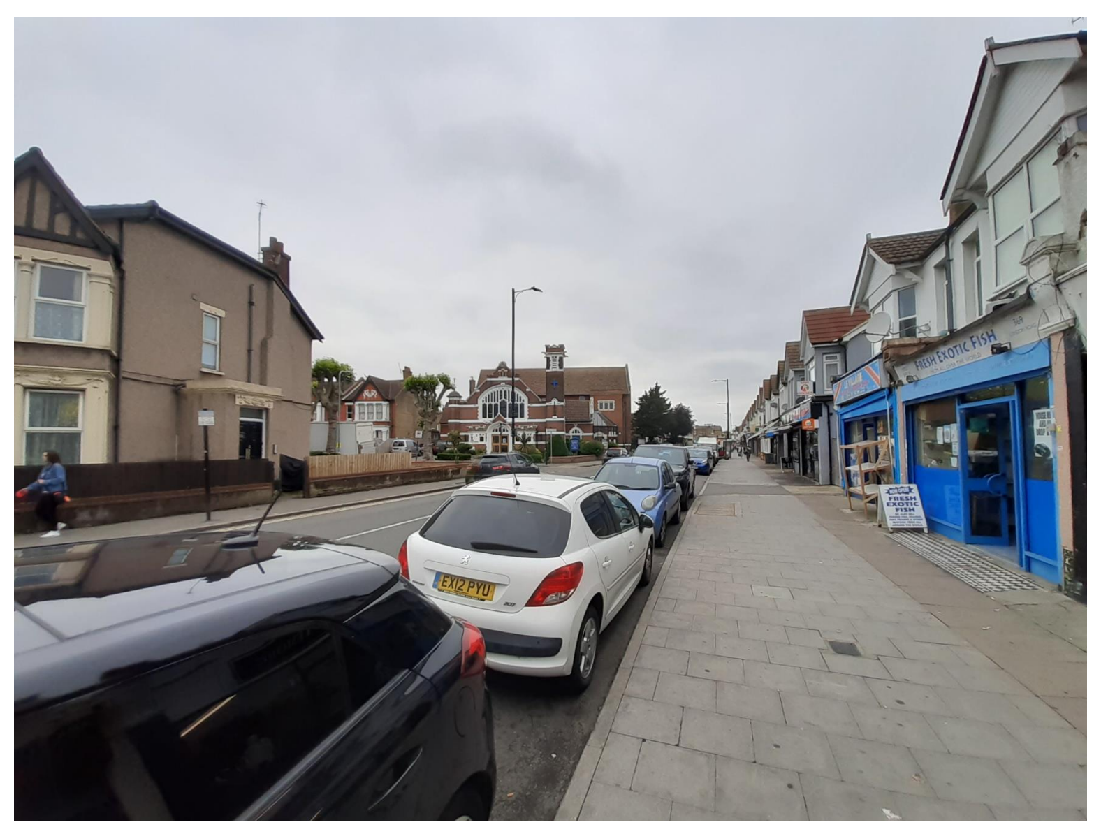
Westward view on London Road