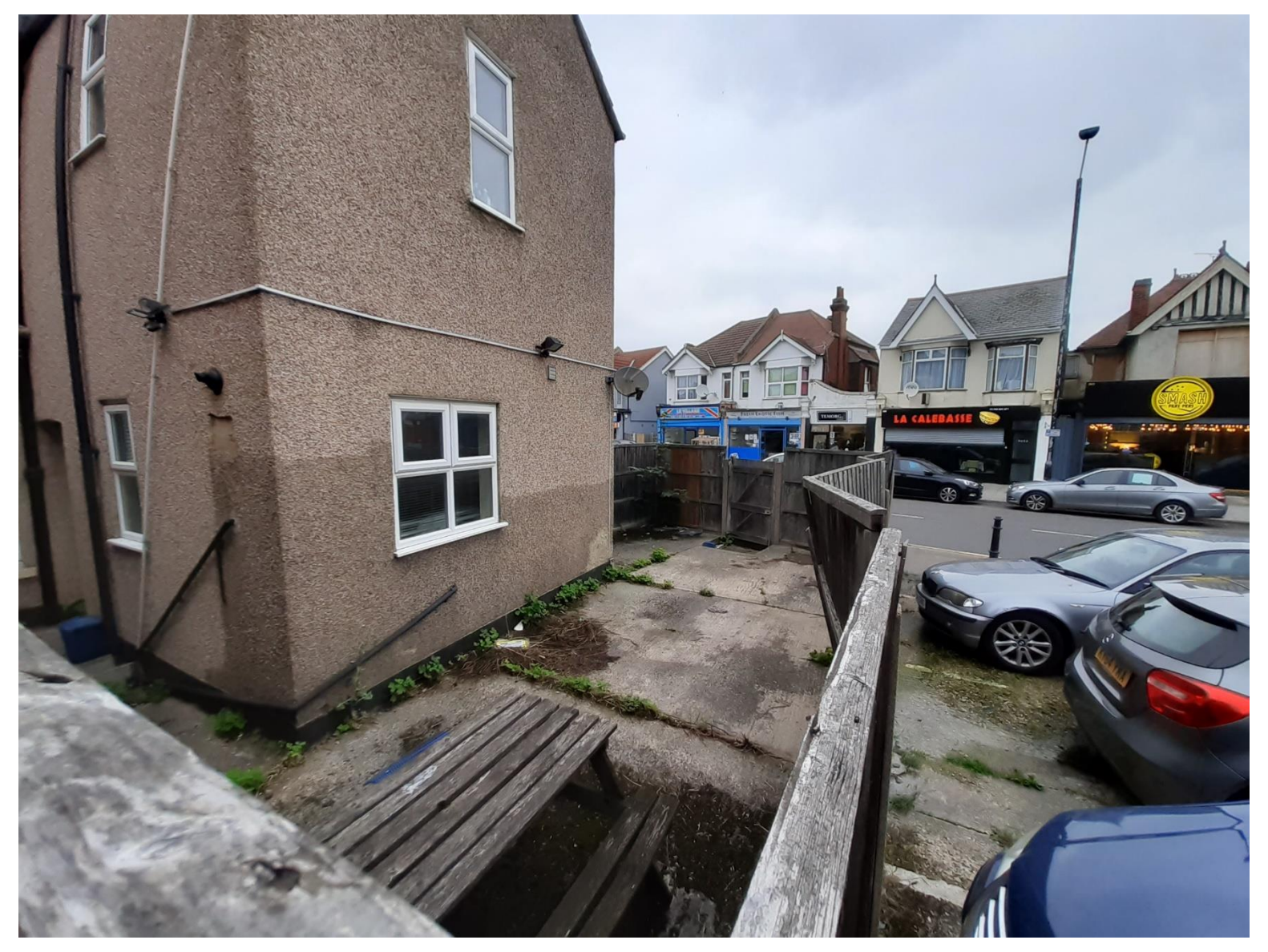
Neighbouring amenity space