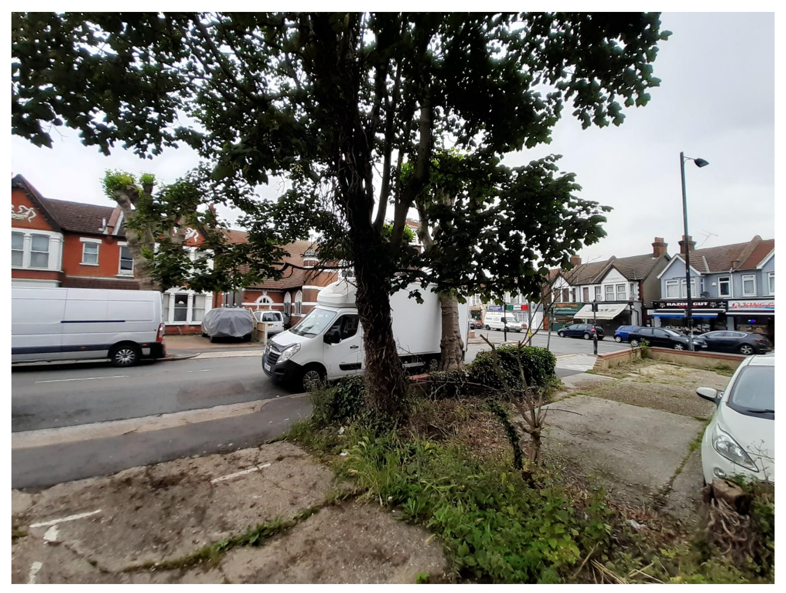
North-westward views from Argyll Road