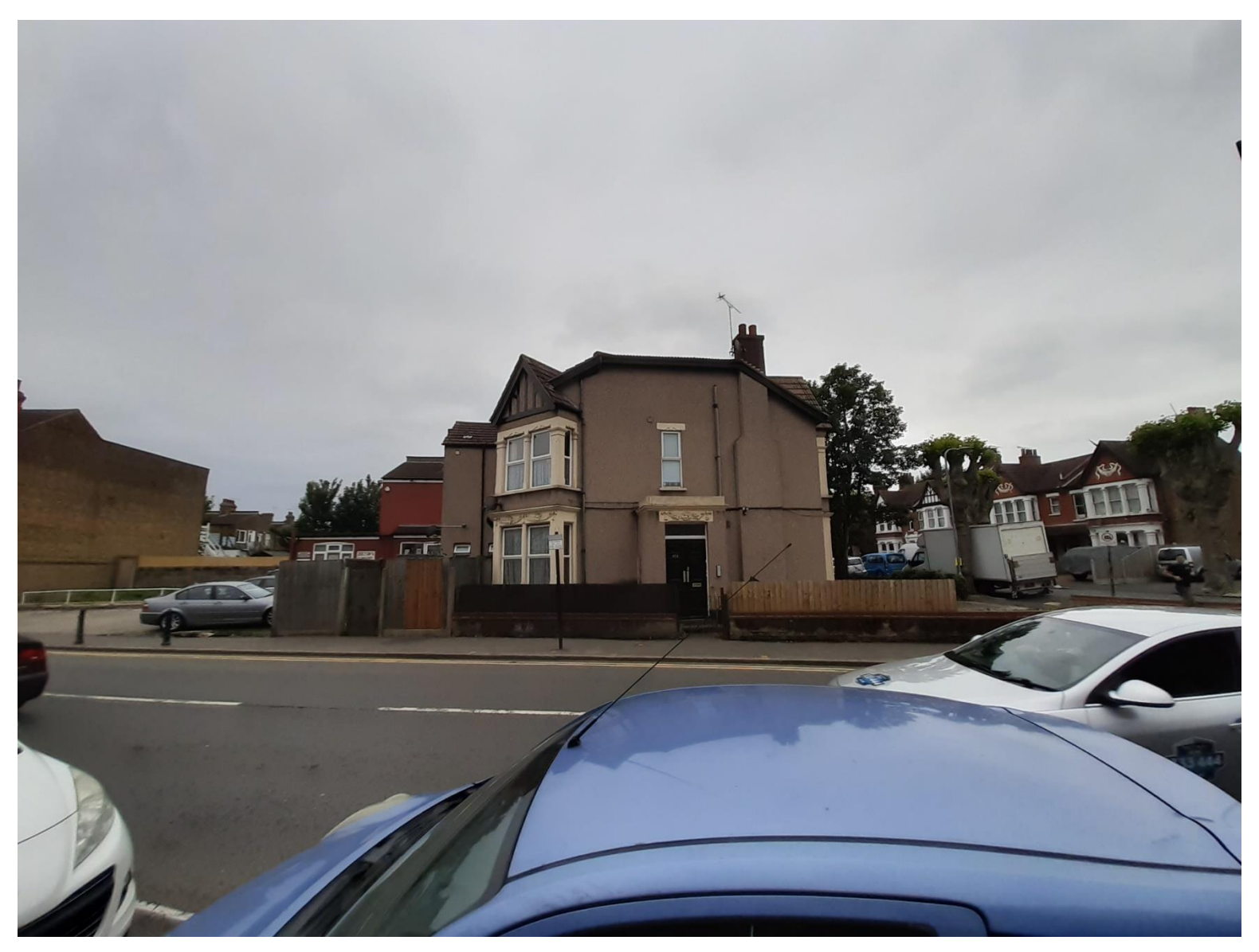
The neighbouring property to the north-west of the site