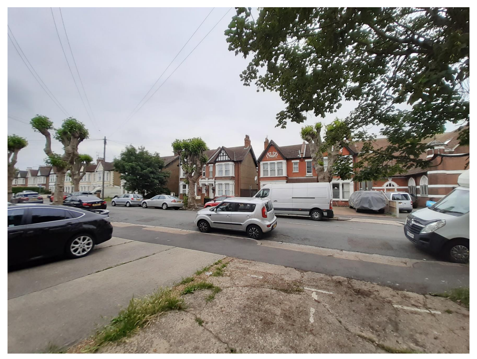
South-westward views from Argyll Road