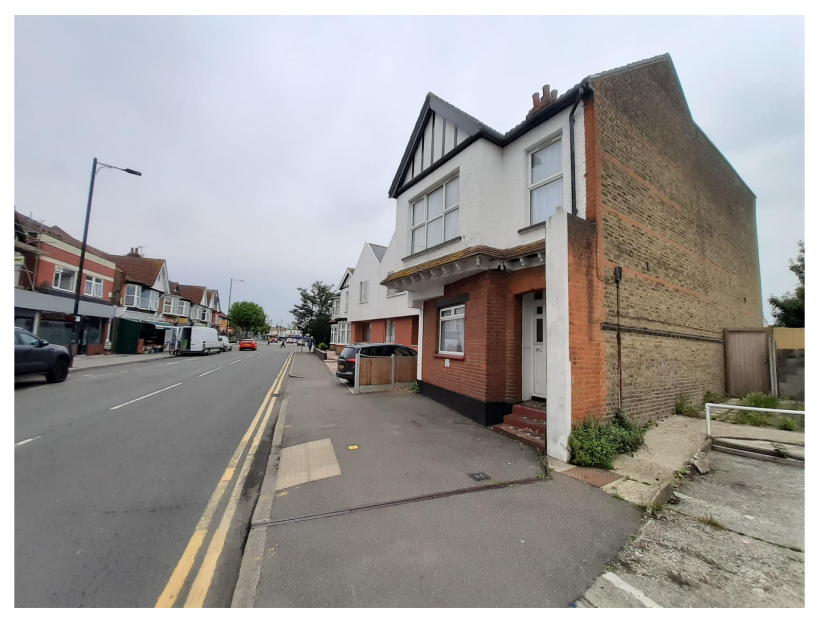
Eastward view on London Road