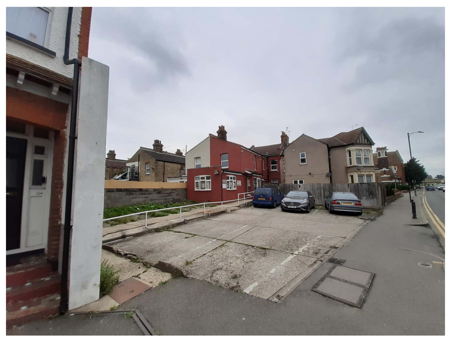
The existing rear part of the site viewed from London Road